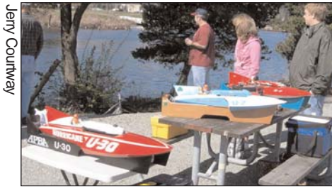
A fleet ready for testing at Lake Union.

The South Lake Union site was discussed. For restroom use, portable potties should be available on site, and the wooden boat center is open during the day as an option. Since the racing day will start with unloading, set-up and testing before the church service starts, there should be no conflict with parking. Racers are encouraged to move their vehicles to the