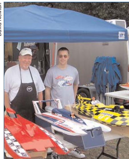
Familiar, friendly faces and a neat fleet.