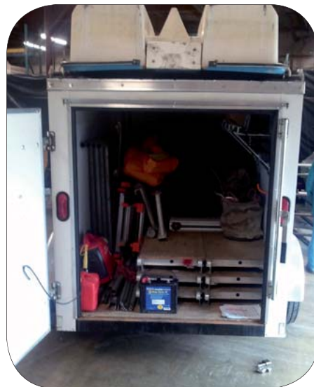
The club trailer is clean, organized and set for the 2011 Red Dot Championship Series presented by Peters & May