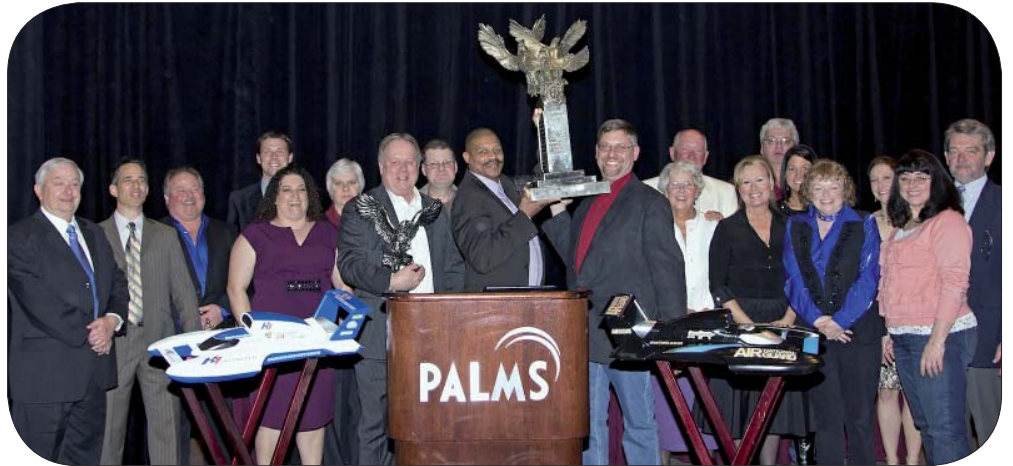
Representatives of Madison, Ind., celebrate receipt of their third straight Martini & Rossi Championship Trophy.