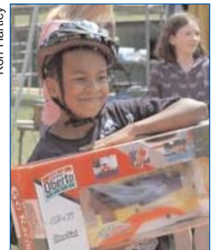
Event sponsors D.A. Graphics and Schumacher Racing Team made several kids very happy with a boat giveaway.