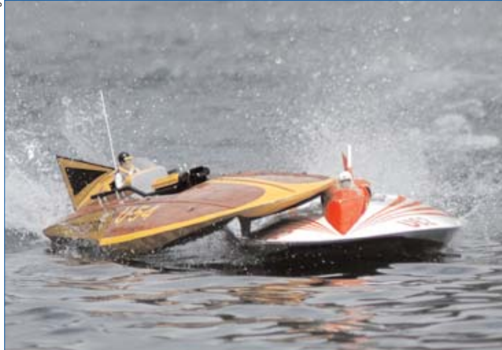
After one of the day's best heats, the Wildroot Charlie mixes it up with the Thriftway Too.

cal gremlins' aboard the Harrah's Club and Outrigger Pay 'n Pak just before the finish line.