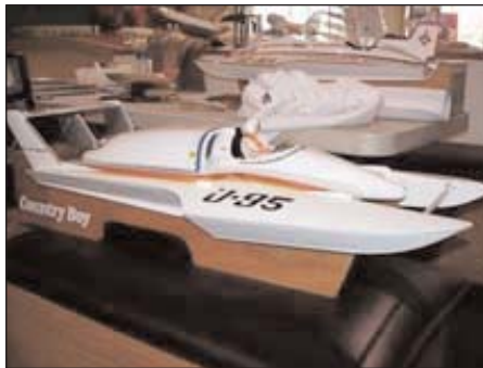
Rick Lentz's new U-95, built by Jeff Campbell, is just about done.

Equipment purchases being investigated include a new amplifier, cable and speakers for the public address system, a club-owned generator, a frequency monitor and a printer for the newly-purchased laptop