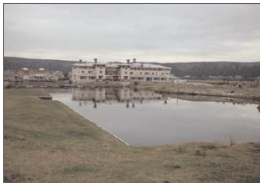
The proposed Port Ludlow race site. To the right of the pond in this photo is the bay. The pits and launch area would be to the left.

There are committee members, even, who have said they believed they would have no trouble helping the club find a