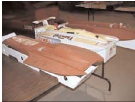
Jerry Courtway's Thriftway Too, Oly and '71 Atlas Van Lines.