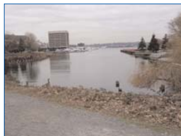
The South Lake Union course site.

The session needs to be set up in the informal fashion in order to stay within the Seattle Parks Department guidelines of not staging a "race" without prior confirmation.