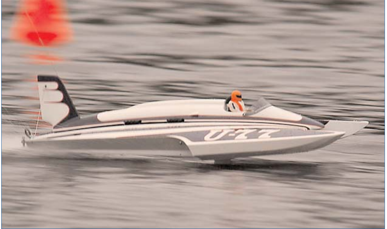
Mike Campbell's Country Boy was second in modern class boat points in 2006.