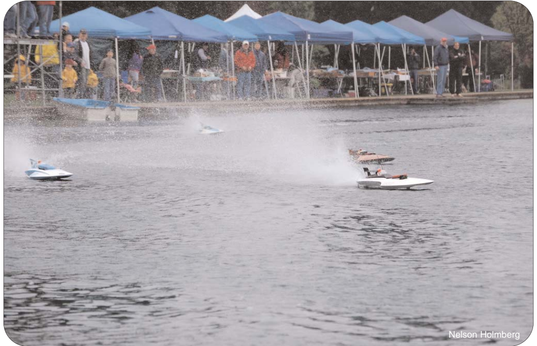
Vintage boats race for the first turn during heat racing at the Rose Festival RC Regatta presented by PC Triage on the Casting Pond at Westmoreland Park in Portland

The modern final start was a mess. Just after the start, three boats got together in the front straightaway and the end result was a