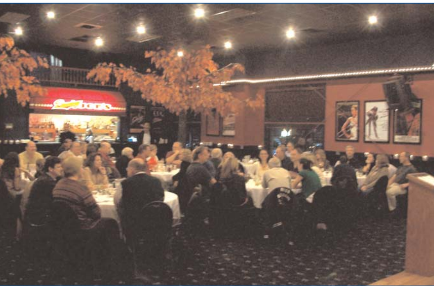
A great crowd turned out for the 2008 ERCU Awards Banquet at the Broadway Joe's Room at Great American Casino in Tukwila.