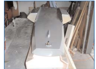
Kirk Pagel's project of changing the Hawaii Kai III into the Hurricane V. Clockwise from upper left: 1) The Kai after taking delivery from Newton Racing Team; 2) After sanding; 3) New cowl and cockpit is complete and primed; 4) Bottom of the boat is painted; 5) It's coming right along, as the deck paint is complete; 6) All done!; 7) The happy new owner and his boat getting ready for the first race.